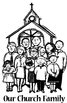
Our Church Family